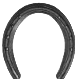
ST. CROIX LITE RIM