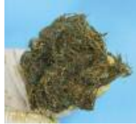
Fig. 4 & 5 - The preferred packing of the EPS at VMCVM is a mixture of oakum, venice turpentinea and copper sulfate.

Areas of separation that are extensive, expand, or do not resolve should be managed by a team consisting of a veterinarian and a farrier. Radiographs, specifically 0° lateromedial and 0° dorsopalmar, should be used to identify the extent of the separation and to guide trimming/shoeing. The principles of treatment are to resect the affected hoof wall and debride to as healthy of a margin as possible (exposes the area to UV light and air), stabilize the hoof capsule, recruit the sole and frog for load sharing, and remove predisposing factors (environment, excess leverage, etc.).