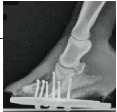
Fig. 3. - Lameness is usually only noted when extensive separation has occurred, resulting in an instability of the distal phalanx within the hoof capsule