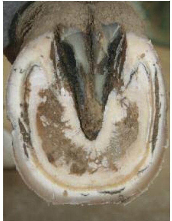
Fig. 1 - Cases of WLD are often first noticed by farriers during routine trimming/shoeing visits. An area of separation in the hoof wall that is filled with dirt/debris is noted.

The cause of WLD has long been debated. Although several theories have been described, none have been proven. The current theory of WLD etiology as described by O’Grady, Moyer and others is that opportunistic, keratinopathogenic microorganisms invade the non-pigmented stratum medium of the hoof wall following an initial separation caused by a mechanical stress or weakness, trauma, abnormal or excessive moisture exposure, or some combination. 1,2 These organisms degrade the keratin in the hoof wall exacerbating the separation. Furthermore, dirt and debris typically fill the separation, acting as a mechanical wedge forcing the wall apart.