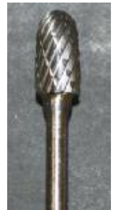
Fig. 7 - Carbide cross cut burrs.