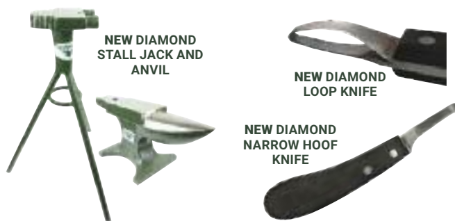
NEW DIAMOND STALL JACK AND ANVIL

Recently, Kerckhaert introduced the new Diamond Tracker horseshoe (right). This shoe features a beveled toe and solid heel area and has been produced in a generic pattern. The steeper bevel in the toe provides good breakover with less chance of slipping and solid heels provide additional support in soft terrain. Compared to the very round shape of the St. Croix Eventer, the Tracker has a more natural shape in the toe and even more so in the branches. Easily shaped into front or hind patterns, the Tracker reduces the number of shoes a farrier needs to carry on their truck and requires less time and effort in shaping for the best fit. The Tracker is quickly making converts out of many Eventer users thanks to Kerckhaert's innovative design and attention to detail.