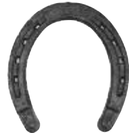
ST. CROIX LITE HEELED