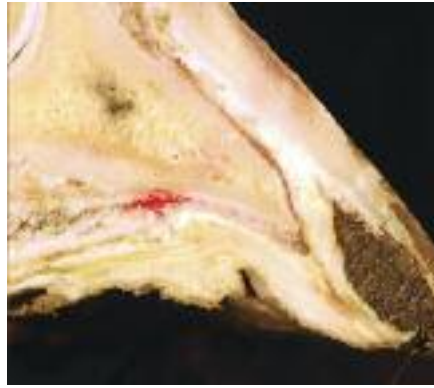
Fig 2. - There can be rather large areas of separation filled with dirt/debris despite maintaining a healthy appearance of the outer hoof wall.

Cases of WLD are often first noticed by farriers during routine trimming/shoeing visits. An area of separation in the hoof wall that is filled with dirt/debris is noted (Fig. 1). When removing the dirt/debris with a hoof knife or curette, an area of undermined hoof of varying degree is revealed. After the dirt/debris is removed, portions of white/grey powder like hoof wall are typically seen before reaching a healthy margin. There can be rather large areas of separation filled with dirt/debris despite maintaining a healthy appearance of the outer hoof wall (Fig. 2). Lameness is usually only noted when extensive separation has occurred, resulting in an instability of the distal phalanx within the hoof capsule (Fig 3).