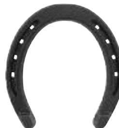
NEW DIAMOND CLASSIC HEELED