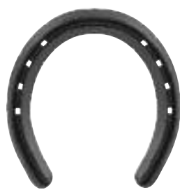
NEW DIAMOND CLASSIC RIM

To-date there have been a number of product improvements and the cumulative effect has been quite significant. While the basic dimensions and shapes of the shoes are similar, the materials are better - and design, especially the crease, nail placement and punching, has been improved; providing the Diamond user with a better product. The photos below show the marked difference in the Diamond horseshoes, along with comparisons to the competitor shoe. The comparison of the shoes makes it clear why Diamond has become the easy choice for farriers who are looking for a quality shoe at a competitive price.