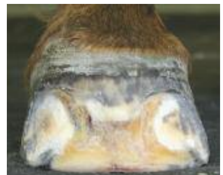
Fig. 8, 9, 10 - A sequence of debridement prior to topical treatment.