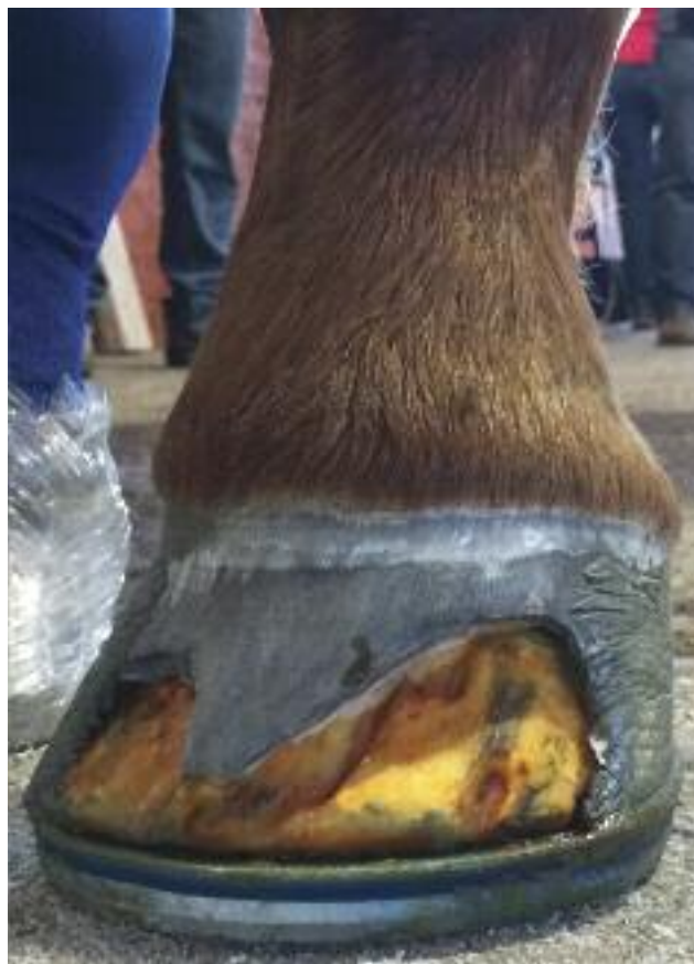
Fig. 11 - It is important to note that affected areas should not be covered with adhesive.

In conclusion, horses being treated for WLD should be kept in a clean and dry environment with minimal variations in moisture level. The hooves should be cleaned out and treated at least once daily. They should be rechecked by the vet/farrier team at 4 week intervals for continued debridement and to monitor the hooves for appropriate growth.