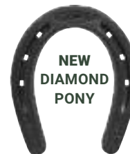
NEW DIAMOND PONY