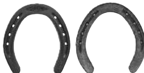
NEW DIAMOND HIND