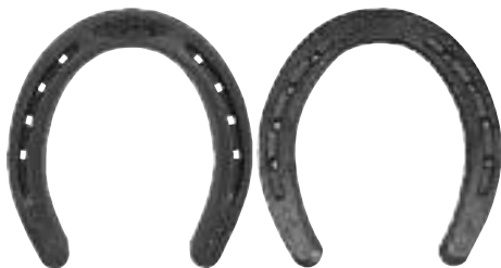
NEW DIAMOND BRONCO PLAIN