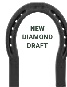
NEW DIAMOND DRAFT