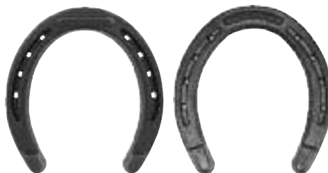
NEW DIAMOND BRONCO TOE AND HEEL