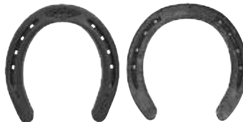
NEW DIAMOND SPECIAL