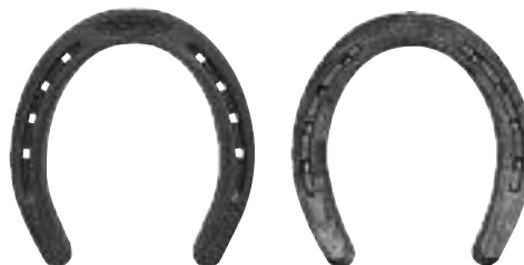
NEW DIAMOND CLASSIC PLAIN