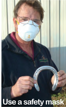
Use a safety mask

Grinding aluminum can be a pain because of the dust and clogging of your belts. The clogging problem is easy to remedy. Take a bar of soap and apply it to the belt like you would buffing compound and you have no more clogging. I like ivory soap best, it sticks to the belt really well, but any bar soap will work. I reapply before each shoe and it doesn't take much. Remember, always wear a good safety mask. You can get them at any hardware store. There are already enough things that can kill us in our profession.