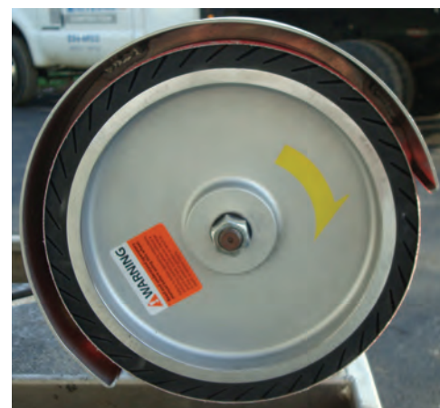
Above: Baldor Grinder with expander wheels.