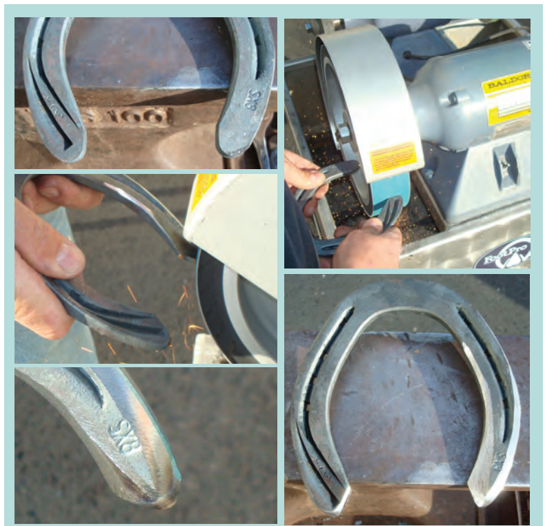
HEEL CHECK AND FINISH

Hopefully you find something in this information you can use that will make your day a little bit easier. ■