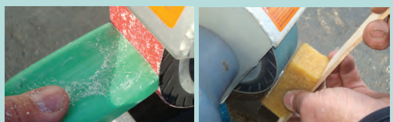
CLEANING AND COATING BELT